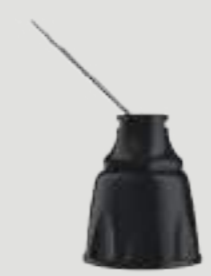
23 Gauge Large