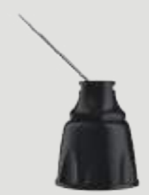
25 Gauge Small