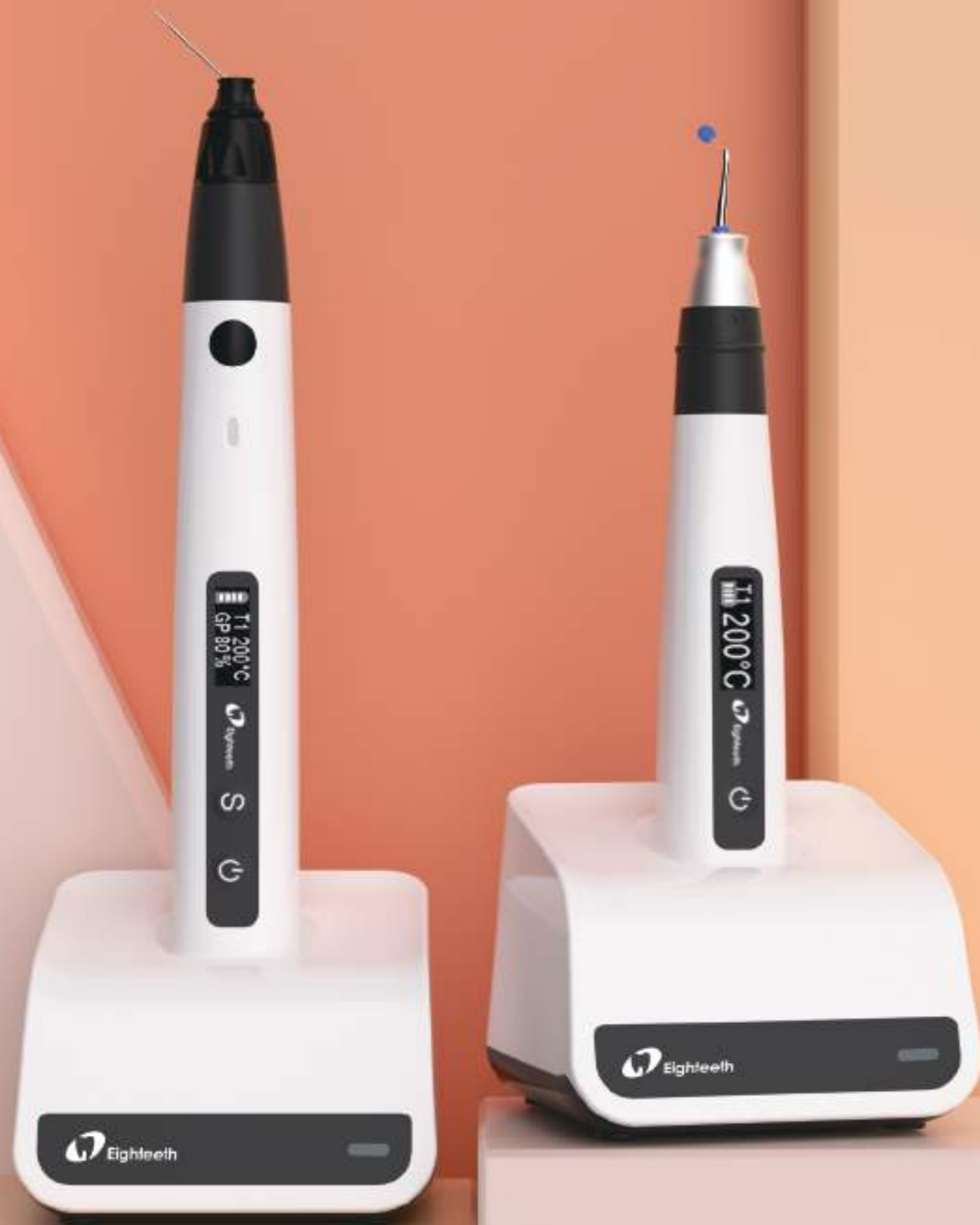
Fast-Pack pro & Fast-Fill