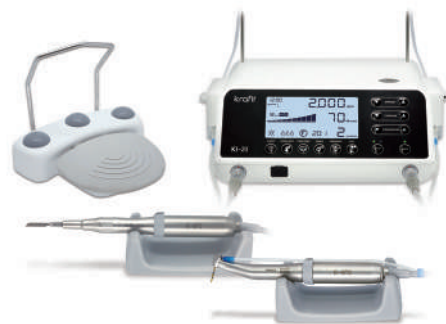
MODEL Ki-20 Advance (Dual)