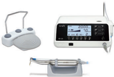
MODEL Ki-20 Advance (Single)