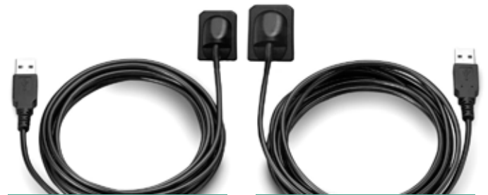
Size 1 - 30 x 20 mm